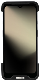
Nautiz X21 Main body

The pictures shown below may differ from the actual products. To purchase additional or optional products, contact our customer center.