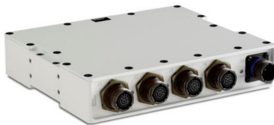
16-port GVA Gigabit Ethernet switch

The launch of the GVA standard in UK coincided with MilDef opening its UK facility in Cardiff and MilDef was soon contracted to develop the GVA Ethernet Switch for the Foxhound Vehicle. This switch has been in service for 10 years and has shown incredible reliability with the Foxhound fleet operational throughout the UK's operations in Afghanistan. With this vehicle now due for upgrade MilDef is able to offer a fit, form and function replacement proving the GVA philosophy as well as MilDef's ability to support its products through the vehicle's service life.