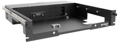
Figure 2 RK10 Army Dock/Server Infrastructure