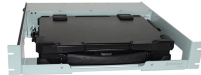
Figure 4 RK10 Navy Dock/Server Infrastructure