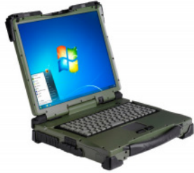
Figure 1 MilDef RK10 (REACHER Configuration)