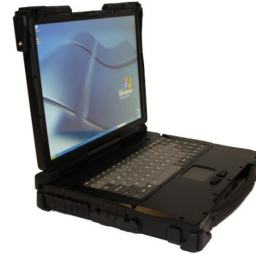
Figure 3 MilDef RK10 (Maritime Configuration)