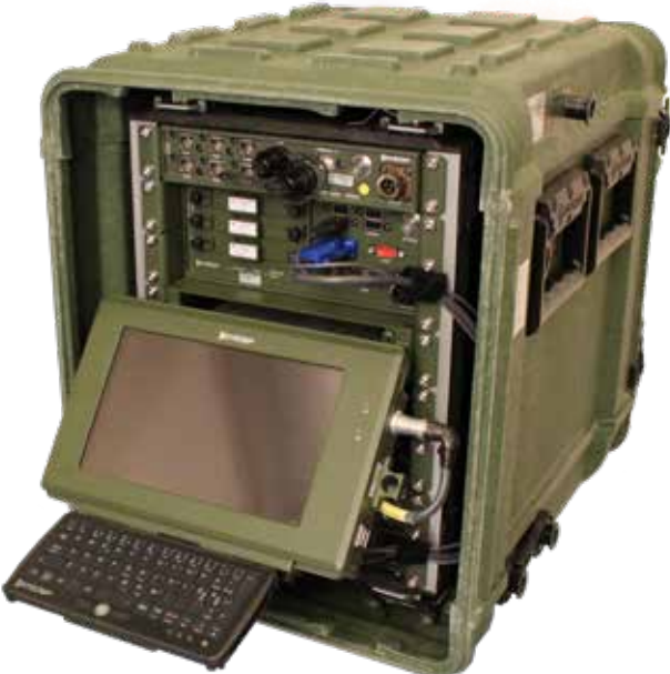
Mobile Core Server System