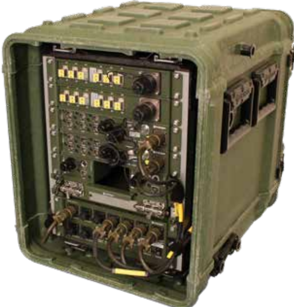
Mobile Core Network stack including UPS