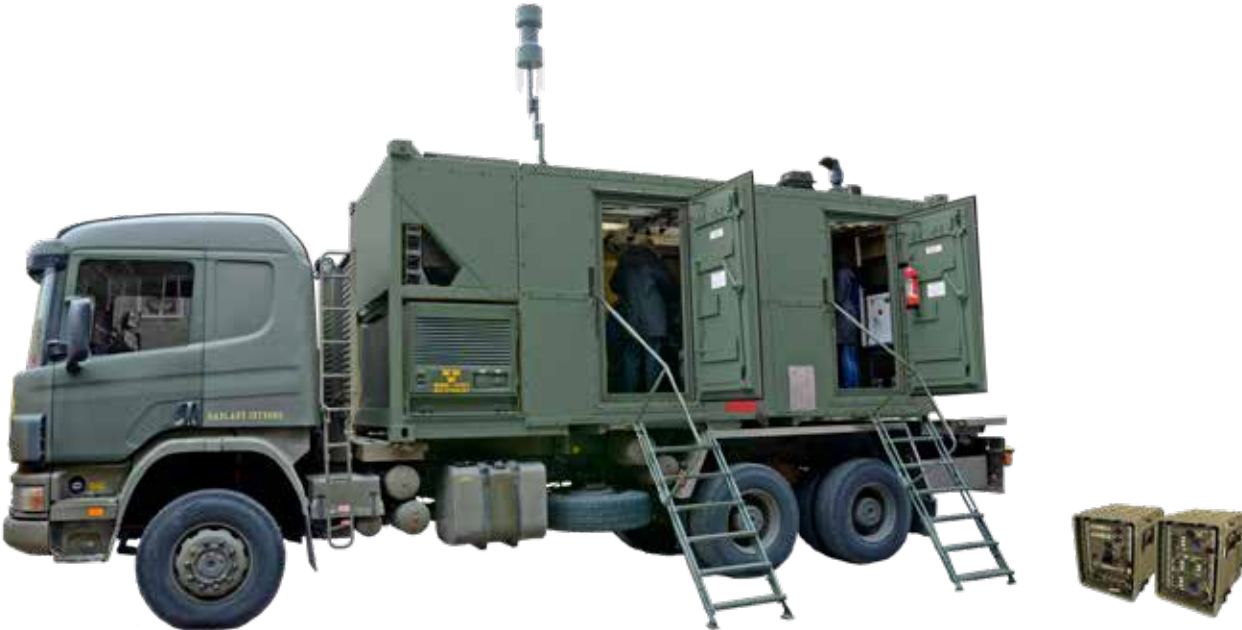
Vehicle-based network node compared to the Mobile Core Network cases